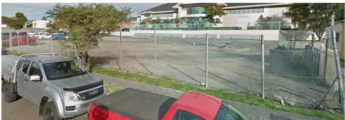
Site photographs (Source: Google maps, November 2016)